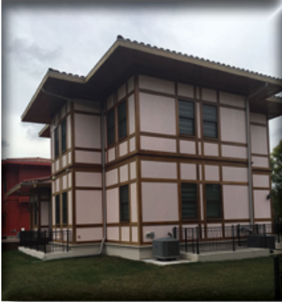
Open Education Bureau in Lanham, US

■ Anadolu University Faculty of Open Education now offers programs in North America. A bureau for open education services was opened in Lanham in 2016-2017 academic year to coordinate the programs in North America.