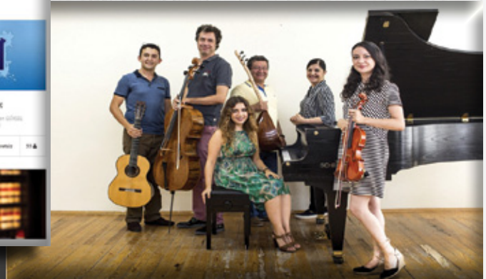
AKADEMA – Instructors of Music Courses

Under Anadolu University Open Education System, AKADEMA offers free online courses for everyone, regardless of age and educational background, since 2015. AKADEMA offers 40 courses under 11 categories, contributing to personal development of learners with new courses and updated course contents. AKADEMA had started with 7 courses. Adding new courses, it started offering 26 courses on November 7, 2016, and 16 more courses on November 14.